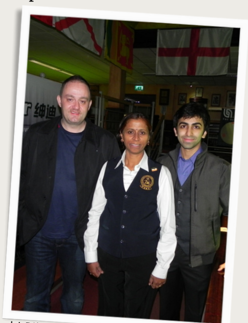
World Billiards Champion Mike Russel and our Star Pankaj Advani

Her victory at the World Billiards Championship sent a powerful message of hope and encouragement to all women who harbored a passion for cue sports, reaffirming that dreams can indeed be pursued and realized.