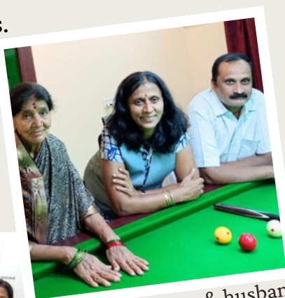
With mom & husband