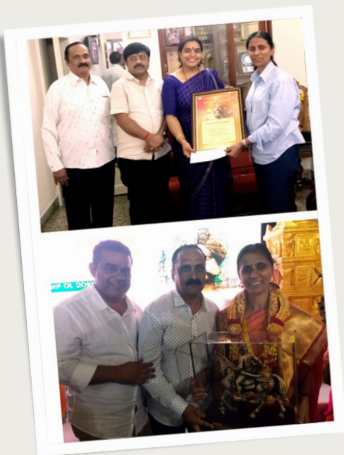
Sri Kempegowda Award 2018