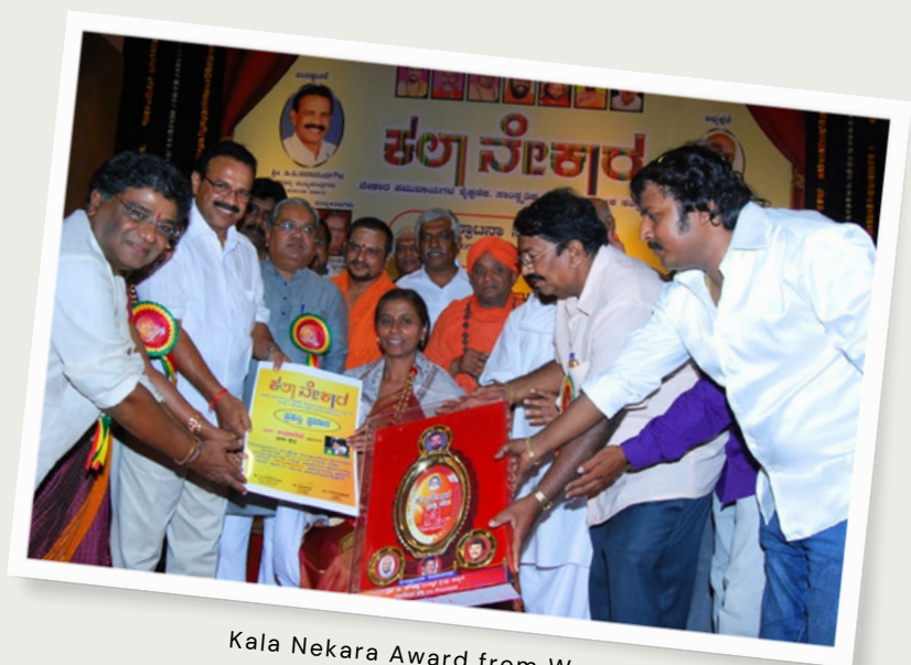
Kala Nekara Award from Weaver's Community

These awards not only celebrate her exceptional contribution to Indian sports but also serve as an inspiring example for young women, encouraging them to embrace cue sports as a viable pursuit.