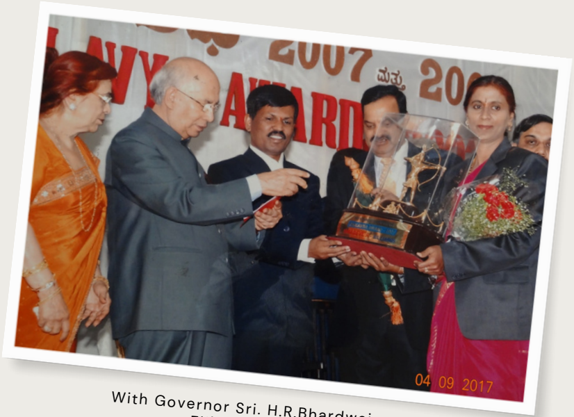
With Governor Sri. H.R.Bhardwaj receiving Eklavya Award - 2007