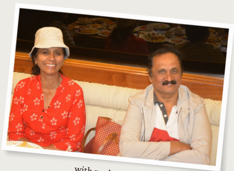
with my husband

He stood by her side, offering unwavering encouragement and support throughout her journey, regardless of her wins or losses. Through all the ups and downs of her life, he remained her steadfast pillar of support. She always credited him for every victory she achieved.