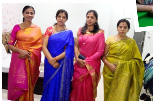
With my sisters