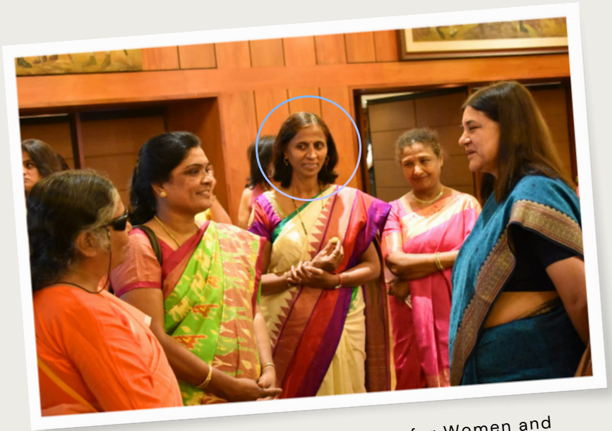
With Smt. Maneka Gandhi, Minister for Women and Child Development Department, along with other Nari Shakti Puraskar recipients.