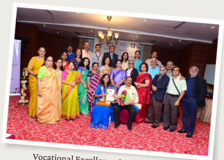
Vocational Excellence Award 2022